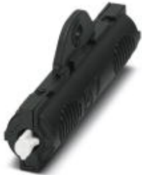
Test pin for SUNCLIX device plug, to check correct positioning of contacts

Please be informed that the data shown in this PDF Document is generated from our Online Catalog. Please find the complete data in the user's documentation. Our General Terms of Use for Downloads are valid ( http://phoenixcontact.com/download )