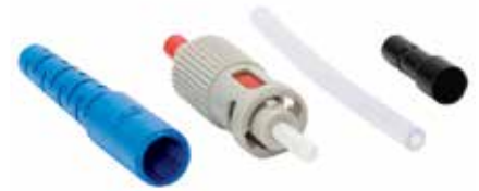
3M™ Crimplok™ ST Connector

3M™ Crimplok™ Connectors need no adhesive, providing the speed of non-adhesive connectors with the optical performance of 3M™ Hot Melt Connectors.