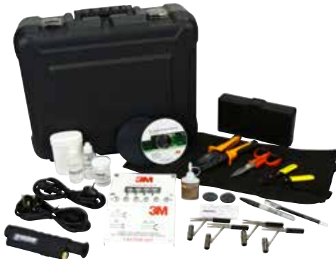
3M™ Hot Melt Termination Kits 6366 and 6362-230V

3M™ Hot Melt Termination Kits 6366 (120V oven) and 6362 (230V oven) contain the tools and materials necessary to terminate 3M™ Hot Melt SC, ST, and FC Connectors, both singlemode and multimode. The 3M™ LC Hot Melt Expansion Kit 6650-LC is used in addition to the 6366/6362 hot melt termination kits to terminate 3M™ Hot Melt LC Connectors.