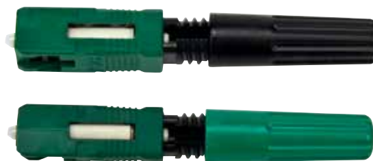
3M™ No Polish SC/APC Connector Flat and Angle Splice 1.6-3 mm Jacket