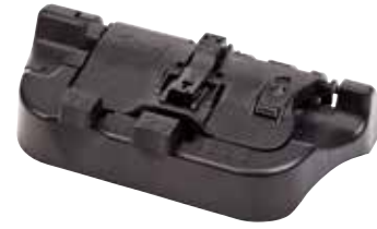
3M™ Easy Cleaver

Unlike other blade-enabled fiber cleaving tools, the 3M Easy Cleaver requires no maintenance because of its diamond wire cleaving mechanism. Use it to create smooth end-faces repeatedly – each tool performs up to 120 cleaves. See the ordering chart for specific details on packaging.