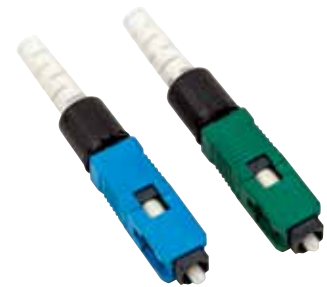
3M™ Crimplok™+ Singlemode Jacketed Connectors