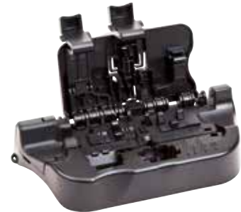
3M™ Easy Cleaver