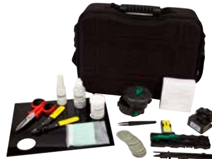
3M™ Crimplok™+ SC/APC Connector Kit 8765-APC for 3M™ Crimplok™+ Connectors 8700-APC