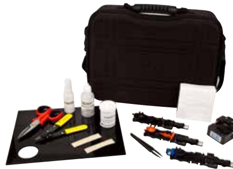
3M™ No Polish Connector Premium Kit with Cleaver 8865-C/PR