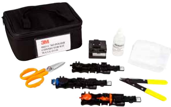
3M™ No Polish Connector Kit 8865-C