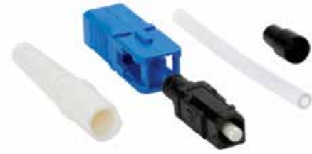
3M™ Epoxy SC Connector

3M Epoxy Connectors feature a pre-radiused, zirconia ceramic PC ferrule designed to provide contact of fibers for low reflection and low insertion loss. The 3M epoxy SC and FC connectors are intermateable within NTT specifications. These connectors are built to exacting ferrule length tolerances for maximum machine polish yield and bulk packaged to maximize factory cable assembly efficiency. 3M Epoxy Connectors can also be used with an anaerobic adhesive for fast-cure interconnect applications.