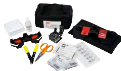
3M™ Fibrlok™ Splice Kit with Cleaver 2559-C

The 3M Fiber Optic Angle Cleaver Kit 2565 provides the tools to terminate the 3M Fibrlok Angle Splice 2529-AS and 2540-AS. Also included in the kits are the 3M No Polish Connector Assembly Tools 8865-AT and 8835-AT for terminating SC and LC angle splice connectors. Replacement parts are available.