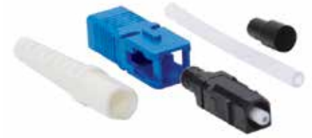
3M™ Hot Melt SC Connector

The 3M Hot Melt LC Connector in both singlemode and multimode has all the advantages of our pre-loaded hot melt technology — and at half the size of our SC connector.