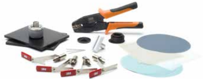
3M™ Hot Melt LC Expansion Kit 6650-LC