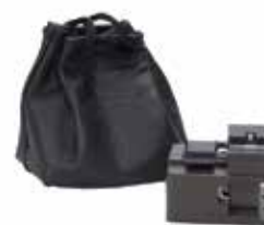
3M™ Cleaver 2534

The 3M Fibrlok Splice Kits for flat splices are available with (2559-C) and without (2559) and contain all the materials needed to terminate 3M™ Fibrlok™ Splices whether it be a singlemode or multimode splice. Detailed instructions are also provided. Included in the kits are the 3M™ Fibrlok™ II Assembly Tool 2501 and 3M™ Fibrlok™ 250 μm Assembly Tool 2504G, simple-to-use tools designed for fast and easy installation.