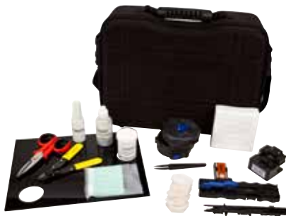
3M™ Crimplok™+ SC/UPC Connector Kit 8765-UPC for 3M™ Crimplok™+ Connectors 8700-UPC and 6700 Series

3M™ Crimplok™+ Connector Kits 8765-UPC/8765-APC provide the tools needed to terminate 3M Crimplok+ Connectors 8700-UPC 6700 and 8700-APC series, respectively. Both kits contain the same fiber preparation tools including a high quality cleaver, a work surface and a case with an integrated hook for easy hanging. Each kit contains a specific 3M™ Crimplok™+ Protrusion Setting Tool and 3M™ Crimplok™+ Nano Finishing Tool, depending upon the connector type. UPC tools provide a square finish while APC tools provide a 8° angled finish.