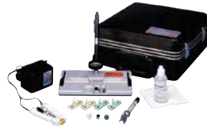
3M™ Multi-Fiber Splice Preparation Kit 2600

The Multi-Fiber Splice Preparation Kit 2600 provides the components required to assemble the multi-fiber splice. The 3M™ Ribbon Construction Tool 2670 provides organization and “ribbonizing” of individual 250 μm coated fibers prior to splicing. The tooling is designed to minimize the required tooling investment.