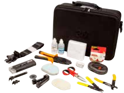
3M™ Crimplok™ Kit 6955 (components loaded in pouch)