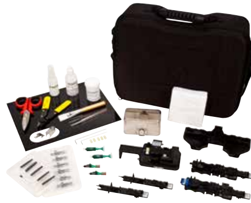
3M™ Fiber Optic Angle Cleave Kit 2565

The 3M™ Fiber Optic Angle Cleave Kit 2565 provides the tools necessary to terminate 3M™ No Polish LC/APC and SC/APC Angle Splice Connectors. The 3M™ Fibrlok™ Angle Splice Assembly Tool 2501-AS is also included to terminate 3M™ Fibrlok™ Angle Splices. Replacement parts are available.