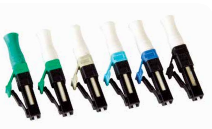
3M™ No Polish LC Connector Family