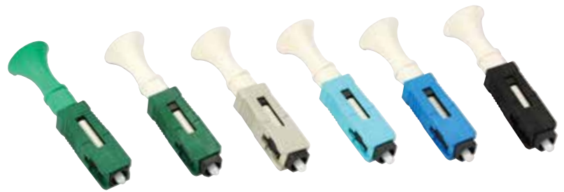
3M™ No Polish SC Connector Family