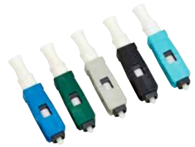
3M™ Crimplok™+ 250μm/900μm Connector Family

Crimplok+ connectors have a thermally balanced design that is tested for premises and FTTP applications for indoor and outdoor conditions.