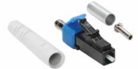
3M™ Hot Melt LC Connector