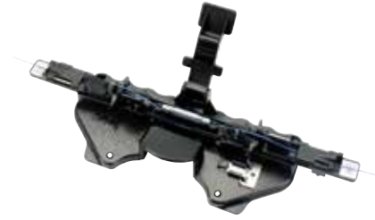
3M™ Fibrlok™ Angle Splice Assembly Tool 2501-AS