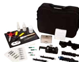
3M™ Fiber Optic Angle Cleaver Kit 2565 includes 3M™ Fiber Optic Angle Cleaver 2535, 3M™ Fibrlok™ Angle Splice Assembly Tool 2501-AS and all tools necessary for 3M™ Fibrlok™ Angle Splices.

The 3M Fiber Optic Angle Cleaver Kit 2565 provides the tools to terminate the 3M Fibrlok Angle Splice 2529-AS and 2540-AS. Also included in the kits are the 3M No Polish Connector Assembly Tools 8865-AT and 8835-AT for terminating SC and LC angle splice connectors. Replacement parts are available.