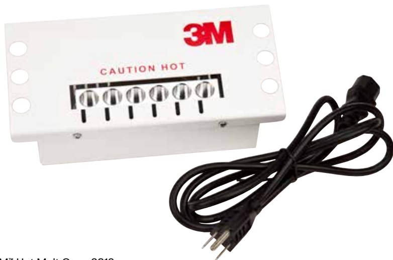
3M™ Hot Melt Oven 6312