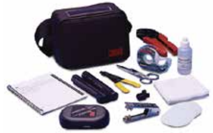
3M™ Crimplok™ Kit 6955 (components displayed)

The Crimplok Termination Kit and accessories provide the tools and materials necessary to terminate 3M™ Crimplok™ Fiber Optic Connectors. Replacement parts are available.