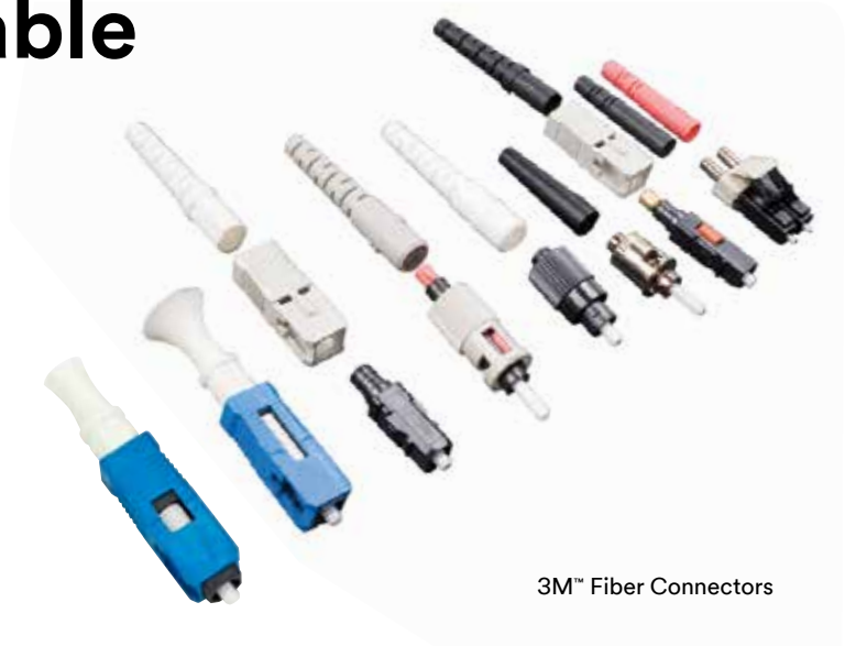
3M™ Fiber Connectors

Reliability and a craft-friendly installations make 3M field installable connectors popular among contractors and industry professionals. 3M connectors can help maximize time in the field with factory-prepped shortcuts and high performance tools. Choose from a full line of fiber connectors with ceramic ferrules.