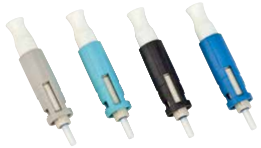
3M™ No Polish ST Connector Family